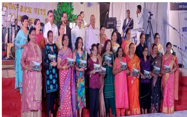
Ex-Teachers being felicitated