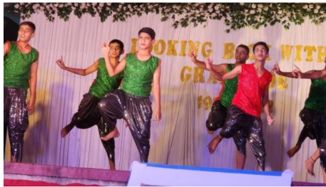
Depict our nation breaking free from the bonds of destitution