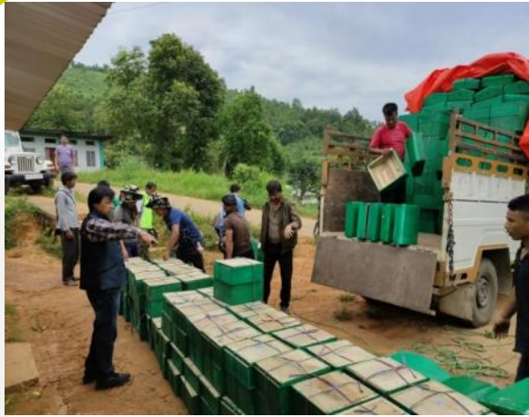
A Govt sponsored Bee Keeping project initiated in Patharlyndan

OUR GREATEST STRENGTH LIES IN THE GENTLENESS AND TENDERNESS OF OUR HEART. RUMI