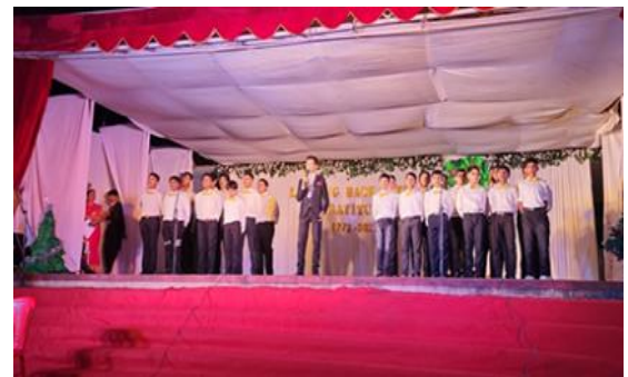
Carols from Scrooge