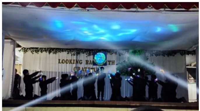
Annual Day Function