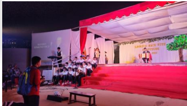
Edmund Rice play