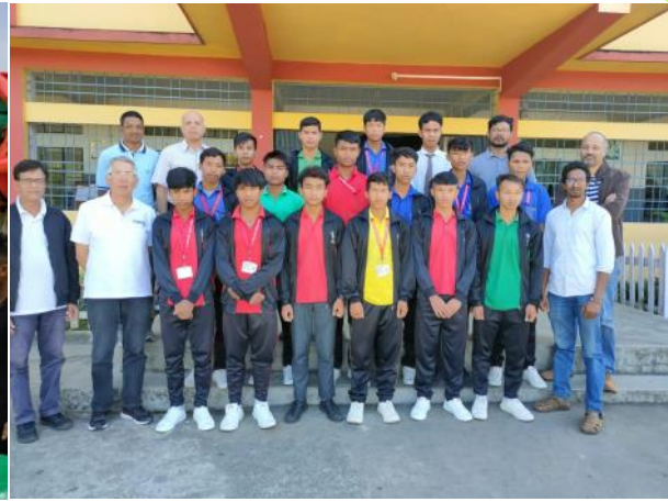
The Brothers have a Vocation Promotion session in St. John's, Jyntru.