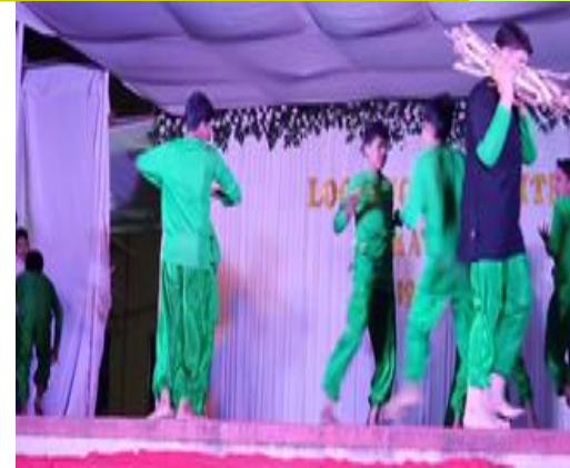
Mourning the cutting of trees