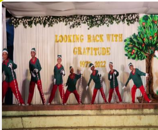
Saving the Trees,