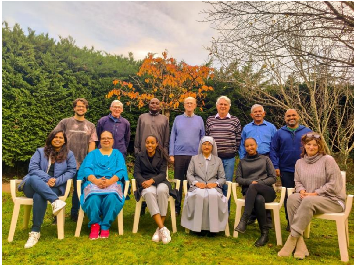
Participants at the Geneva training.